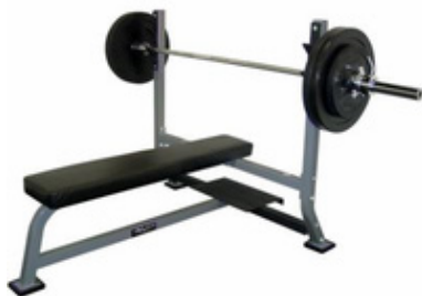
Standard weights bench

A wider bench will provide a person with reduced core strength or reduced balance greater support and stability when doing free weights. The bench can also be coupled with a velcro strap to add extra stability.