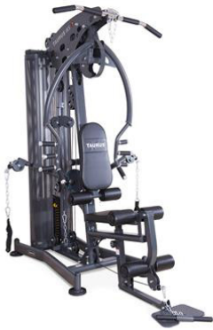
Standard resistance machine

Accessible resistance machines have a seat that can swivel out of the way and has high contrast handles, levers and buttons.