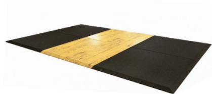
Accessible weights platform