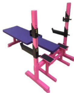
Accessible weights bench