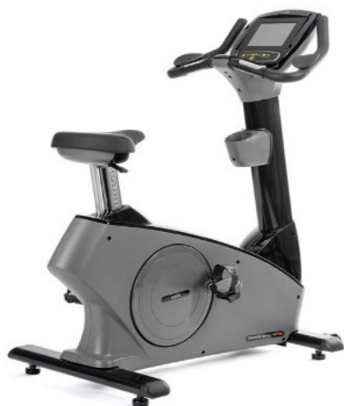
Standard exercise bike

This bike should have a large display screen, high contrast handles, adjustable sliding seat and no barrier to step over to get on the bike.