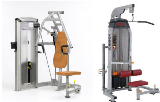
Accessible resistance machines