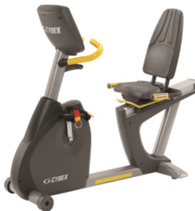
Accessible exercise bike