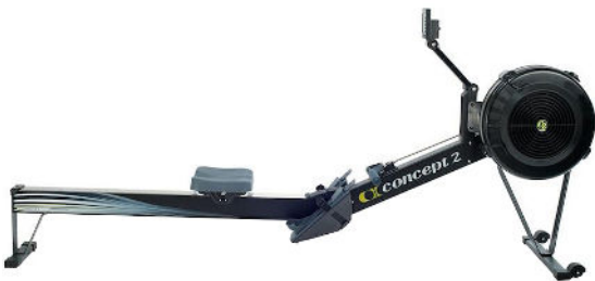
Concept 2 rowing machine

An adaptive seat allows people with many types of disabilities to use the rowing machine. Different versions of the adaptive seat are available. Higher support seats will provide more support to people that need more core or high level support. The adaptive seat in pictures 1 & 2 can be used by everyone, picture 3 is an adaptive seat which offers increased support to a person with a spinal cord injury.